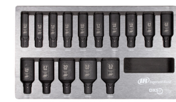
DXSK2M15L - DXS2™ Drive Deep Metric Impact Socket Set, 15-Piece