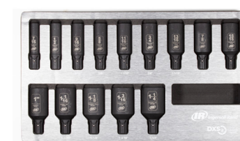
DXSK2H14L - DXS2™ Drive Hex Deep SAE (Imperial) Impact Socket Set, 14-Piece