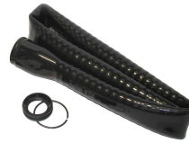
LG1-K284 80152119 Piped-away exhaust kit