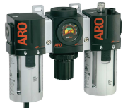
Filters, regulators, lubricators For the complete range, see our accessory catalogue.