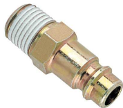
77NMC2 88104070 7N7/7S7 Series nipple, 1/4" male thread, 7.2 mm bore (EURO 7.2 - 7.4)