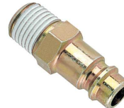
IB6NMC2 88103015 IBN/IBS Series nipple, 1/4" male thread, 6 mm bore (ISO6150B / MIL-C4109)