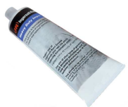
67-4T 04637336 Grease for high-speed angle heads