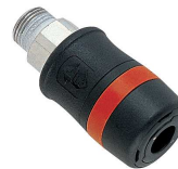
Quick Release Couplings For the complete range, see our accessory catalogue.