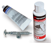
67-LBK1 04637344 Lubricant kit for angle head tools