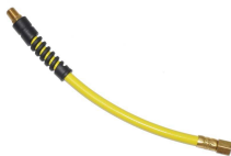
33104-45 92938760 Hose whip, 1/4" NPT, 6 mm inside diameter, 45 cm (1.5 ft)