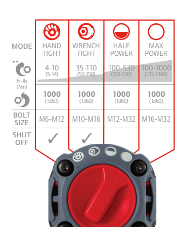
*Requires 5.0 Ah battery for maximum performance

Patented IQ<sup>v</sup> Power Control System includes 4 modes —max power, half power, wrench tight, and hand tight—so there is no need to switch tools