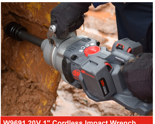
W9691 20V 1" Cordless Impact Wrench