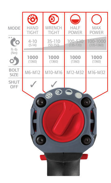
**Requires 5.0 Ah battery for maximum performance

Patented IQ<sup>v</sup> Power Control System includes 4 modes —full power, half power, wrench tight, and hand tight—so there is no need to switch tools