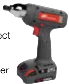
QX Connect Series™ Precision Screwdriver

Lean on the expertise of our Certified Ingersoll Rand Engineers for the installation and commissioning of your new tools to ensure you start right and launch into production without costly delays.