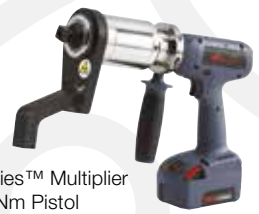
QX Series™ Multiplier 1,000 Nm Pistol