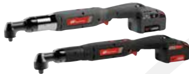
QX Connect Series™ Angle Wrenches