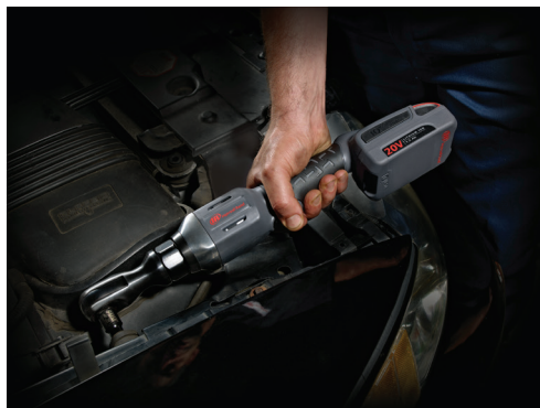
R3130 20V Ratchet