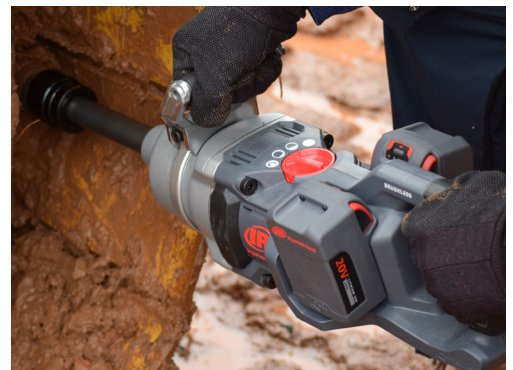
W9691 20V 1" Cordless Impact Wrench