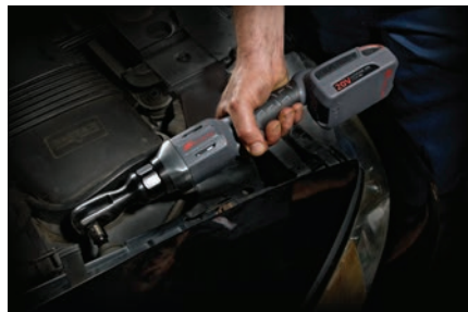
R3130 20 v Ratchet