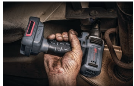
W1110 12 v Quick Change Impact Wrench