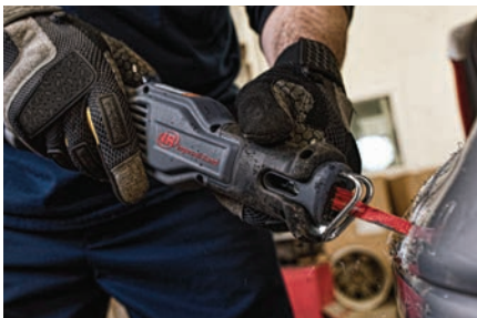
C1101 12 v Reciprocating Saw